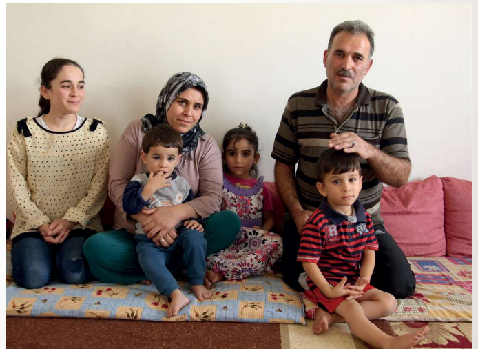
A Kızılaykart beneficiary family living in Gaziantep

“ Something that is very important is that the project provides assistance directly to the beneficiaries and it is very cost efficient. More than 85% of the total amount goes directly to the refugees. ”