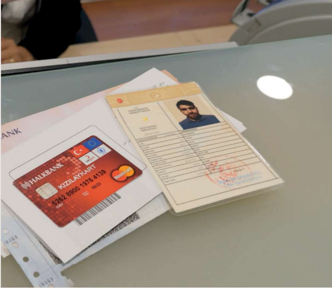
Kızılaykart and Temporary Protection ID Card

“ In accordance with the law no. 6458 on Foreigners and International Protection, the ID number is given to the foreigners by Directorate General of Population and Citizenship Affairs within the framework of the 8'th article of the law no. 5490 on Population Services whose personal information are provided through electronic platform by Directorate General of Migration Management. ”