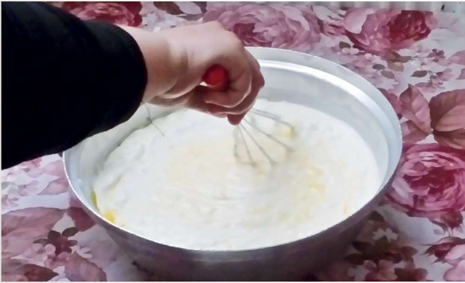
The lady of the house is cooking traditional Lebeniyye food