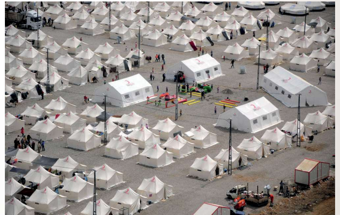
A temporary accommodation center established for refugees within the scope of Syria Humanitarian Aid Operation

Migration is a social fact that has emerged in the trigger of the demands and the needs of the dynamic existence of humanity. From the past to the present day, the mobility of people on the earth has caused social, economic and political changes in terms of the target countries; as well as the emigrant countries and the transit countries along the migration routes. In this respect, migration is considered as a factor that cannot be ignored in the strategic priorities and policies of the states and the internal codes of societies. Migration is closely related with politics, economy, social and cultural life. In particular, international migration affects many states at the same time. Most of the time, it provides labor force to the settled country, brings different skills and new ideas, and on the other hand it can cause loss of skilled labor in the source countries. Therefore, immigration also concerns countries that migrants leave behind as well as the countries they settle in and shape the interaction between these countries and leave permanent traces.