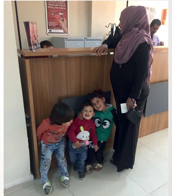
A mother is submitting her official documents to the Service Center