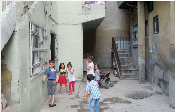
A beneficiary household in Şanlıurfa

The expert in the field takes a picture of the scene encountered in the household and reports it. He doesn't favor anybody, he doesn't misuse his duties. We will check the families again and again through different experts who start to benefit from the SASF Allowance. The SASF Allowance will be carried out for 5% of all applications made through related SASF; for our foundation, this means 50 families. We can visit them every month. I applied the SASF Allowance; I was directed by social scrutiny officer correctly or I was directed wrongly; we will be able to detect it through the multiple visits. The social scrutiny officer prepares the report and submits it to the delegation; the board of trustees will make the decision.