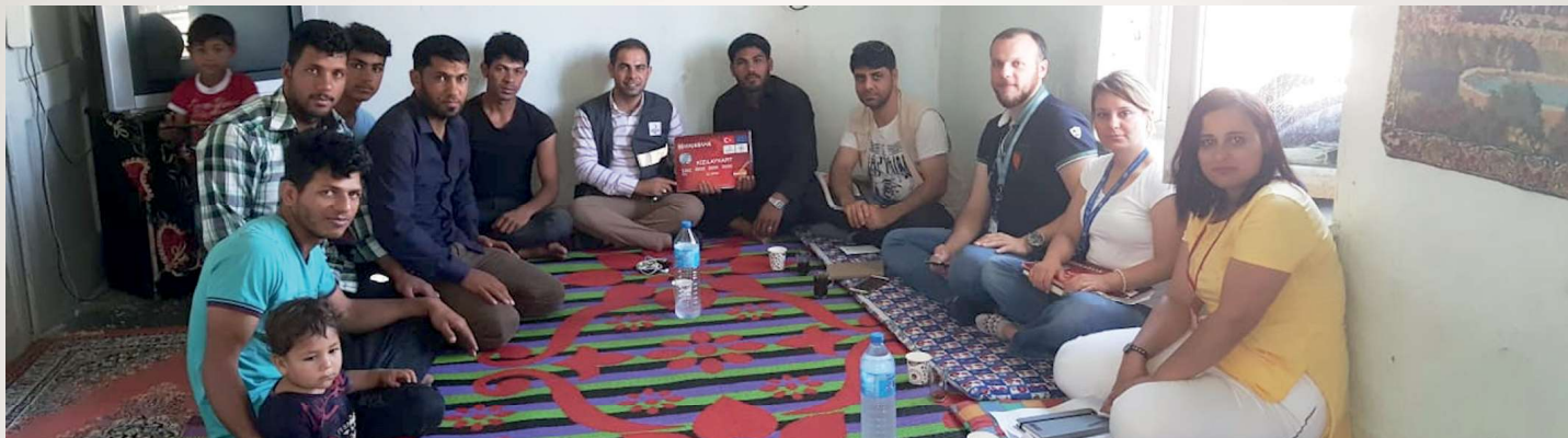
Turkish Red Crescent and WFP staff in a household visit