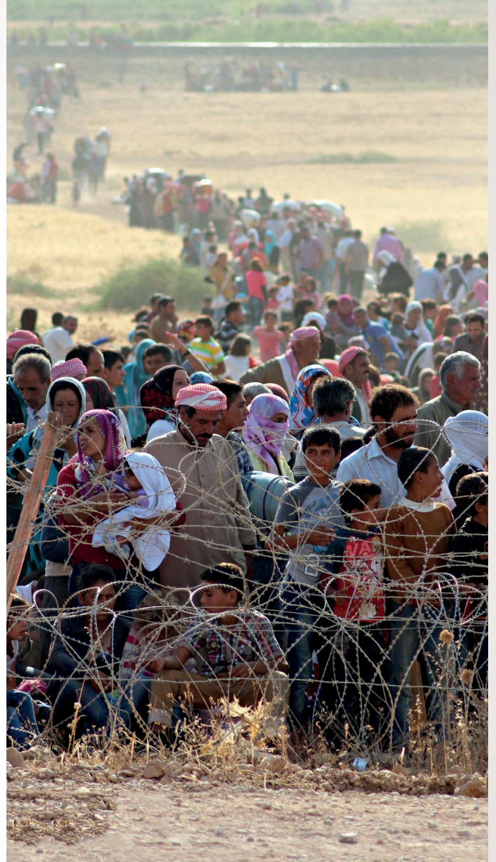
The traces of migration that Turkey faces

With the Law on Foreigners and International Protection, the basis of our national policies in the area of migration and international protection (asylum) has been established and the legal framework for the rights of the refugees and asylum seekers has been adapted to international standards and obligations.