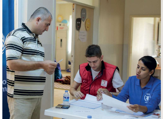
WFP and Turkish Red Crescent staff in a card distribution activity

For both Turkish Red Crescent and WFP, we believe that we know the right response to crisis situations however we need to remain open to learn and improve. I am happy to see that all indicators regarding ESSN show that the assistance is working as the poverty level of our beneficiaries is reducing. The poverty level has reduced from 21% to 11%; so this means before they start getting assistance, they were extremely poor but now the situation is better.