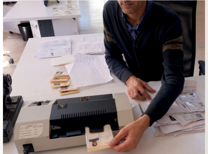
While a temporary ID was being produced in Migration Management office

“ Turkey is still seen as transit and destination country by migrants. ”