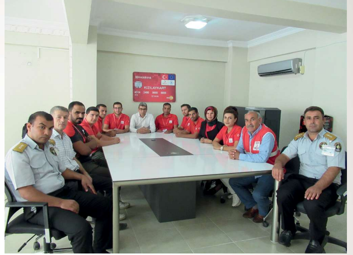
Turkish Red Crescent Haliliye Service Center Staff

We met an elderly lady during the household visits. She asked us that, what we were doing; we stated that we conduct visits to the households for the ESSN Programme. The lady invited us to her house. Together with her two daughters and 5 orphaned grandchildren, we witnessed the struggle of her for survival in very difficult conditions. We contacted the Turkish Red Crescent Service Center to examine her situation. Due to a problem with Mernis registration, we have learned that they have never benefited from the ESSN. We applied to the relevant institutions to solve the problem. As a result of the application procedures, the ESSN cash assistance was provided to the household. This elderly lady we have visited in the following dates, was thanking us; expressed her gratitude to the programme.