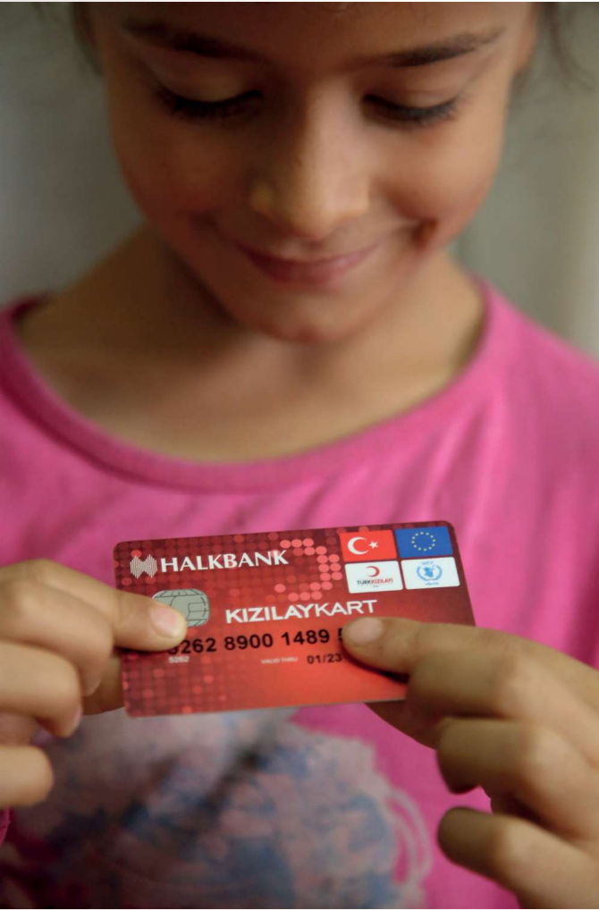
One of the tiny faces of Kızılaykart