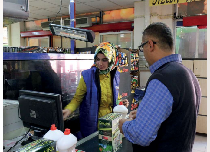
A beneficiary is shopping with the Kızılaykart in the supermarket

The ESSN programme also positively impacts the local economy because people are spending their money in local shops and markets. This contributes to building social cohesion between refugees and the local communities.