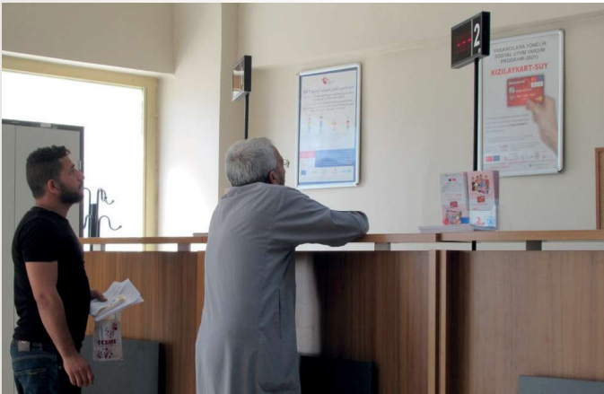
ESSN Applicants in Haliliye Service Center

“The majority of families who benefit from the ESSN in our city are vulnerable Syrians.”