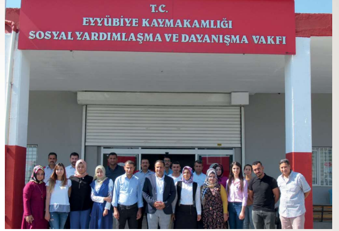
Şanlıurfa Eyyübiye SASF

Can you give information about the coordination / cooperation between Eyyübiye SASF and the cooperated institutions during the implementation process of ESSN Programme?