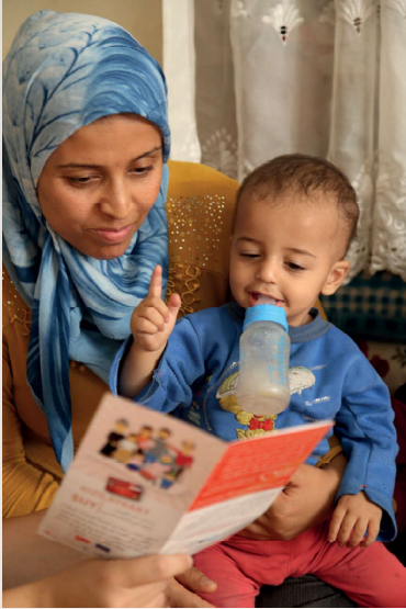
A Kızılaykart beneficiary is looking at the ESSN Programme brochure