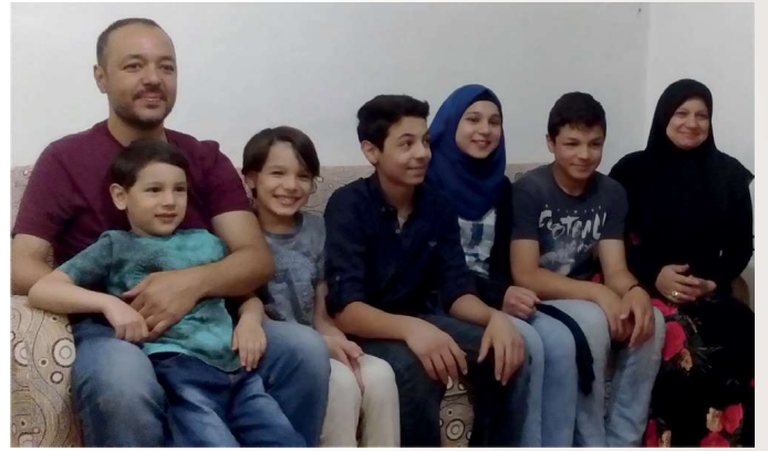
Wais family began a new life in Turkey