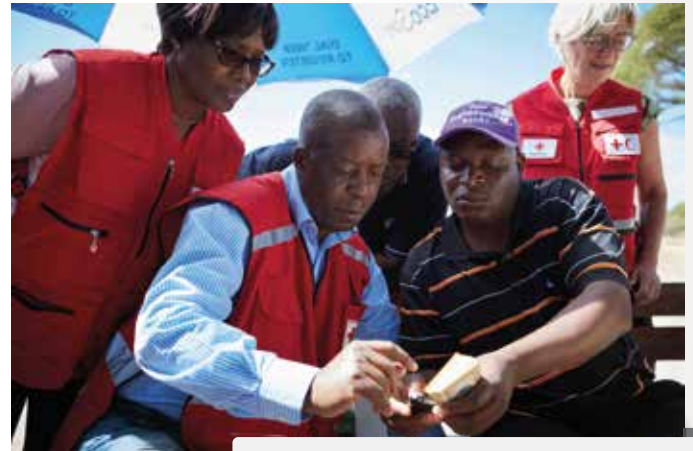
While the platform staff was disbursing cash assistance

“ As a member of the International Red Cross and Red Crescent Movement, Türk Kızılay, which is implementing the world’s biggest cash based assistance programme cooperatively with World Food Programme (WFP) will also be a representative in the Cash Hub. ”