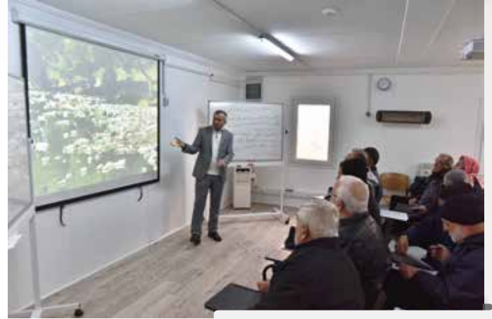
A scene from the adult training group

As of January 2019, the target set by our program partners was reached, which was to let 450 thousandth children benefit off from the program at least in one payment period. As of the relevant period, the number of children benefited off from the CCTE at least in one payment period was 487 thousand. Negotiations between the program partners on the revision of targets is continuing after the target number of beneficiary children reached by the January.