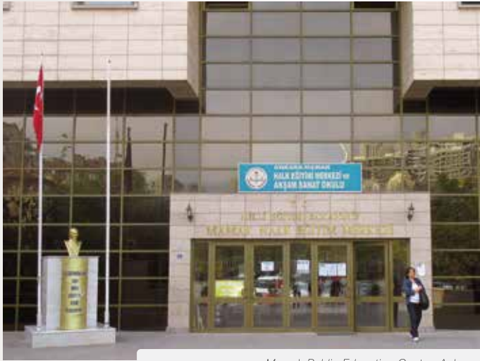
Mamak Public Education Center, Ankara