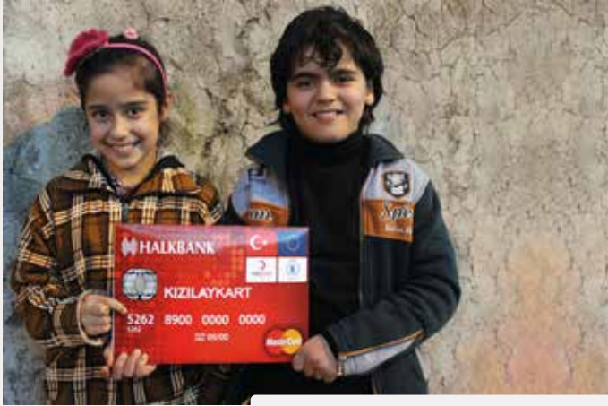
Two siblings who benefit from the CCTE Program