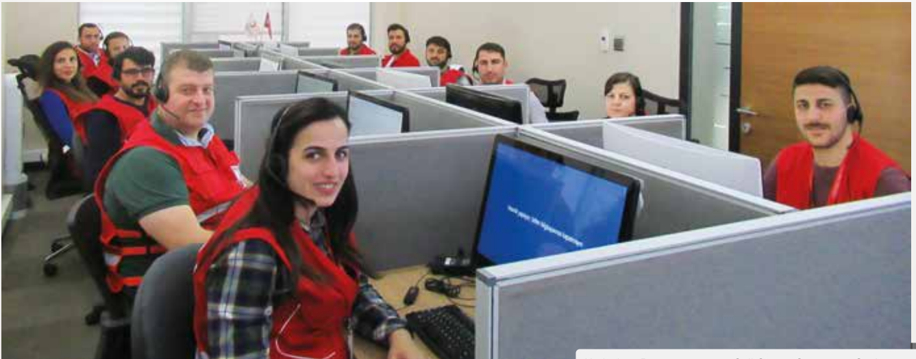
Kızılaykart Programmes 168 Call Center Operators, Gaziantep

Since the first day of the Syrian Crisis, our Call Center staff undertook significant responsibilities to mitigate the effects of unexpected migration movement towards our country. Some of these responsibilities are carrying out consultancy and guidance services for the target group under the roof of our institution.”